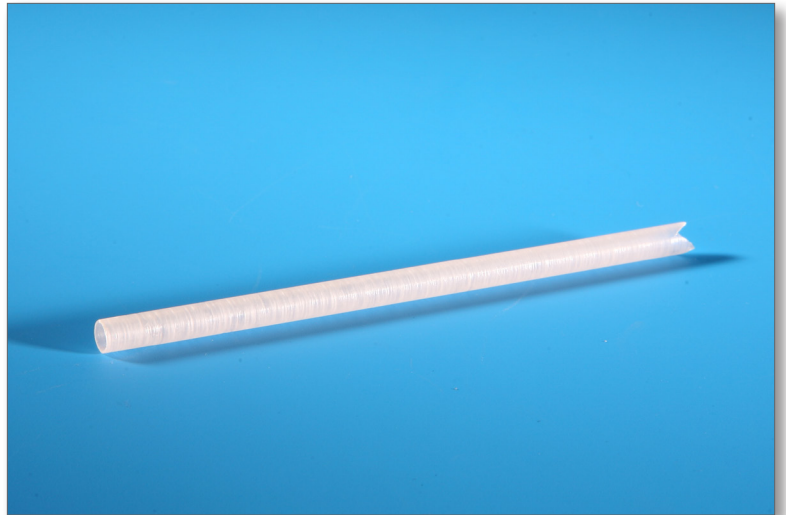
Fine Ground Sapphire Finish

Fine Ground Sapphire is frosted. It's ground surface roughness can be fine tuned for diffuser & low stiction applications. Fine Ground Sapphire tends to have micro-cracks that can trap water, gas & other impurities.