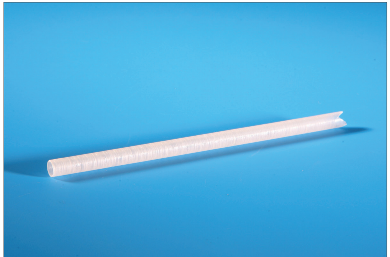
Fine Ground Sapphire Finish

Fine Ground Sapphire is frosted. It's ground surface roughness can be fine tuned for diffuser & low stiction applications. Fine Ground Sapphire tends to have micro-cracks that can trap water, gas & other impurities.