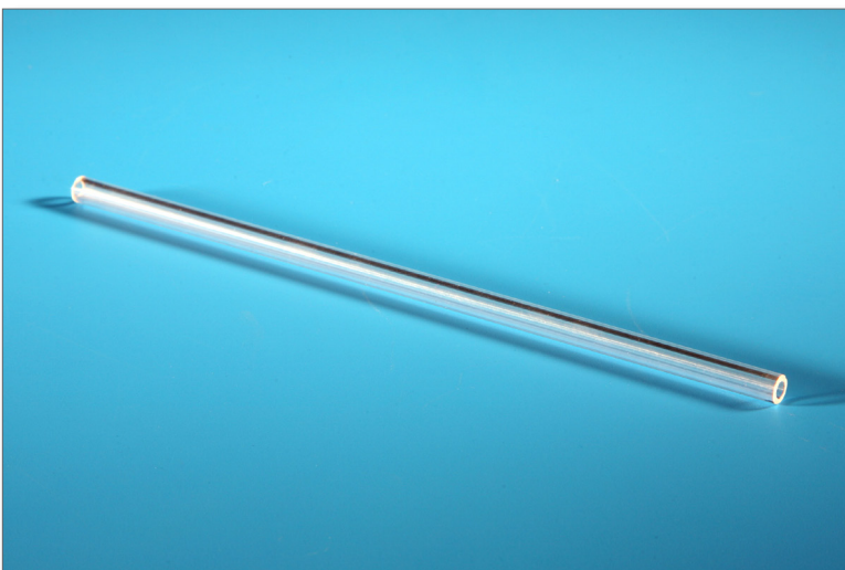
Polished Sapphire Finish

Polished Sapphire is clear and has little to no distortion & light scattering (depending on level of polishing). Polished Sapphire is ideal for optical applications, high purity semiconductor, chemical & vacuum processing.